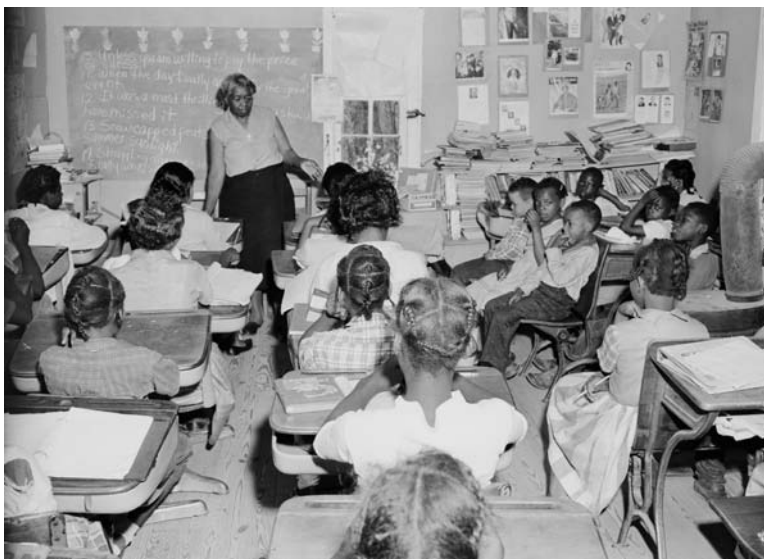
“Crowded Segregated Classroom,” ca. 1940s