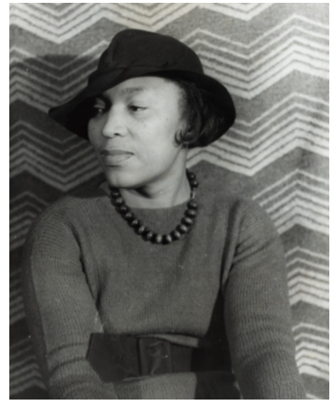
Above: Novelist Zora Neale Hurston, April 1938. Hurston worked for the Federal Writers' Project in Florida, collecting personal histories from rural Floridians that informed her celebrated 1937 work, Their Eyes Were Watching God.