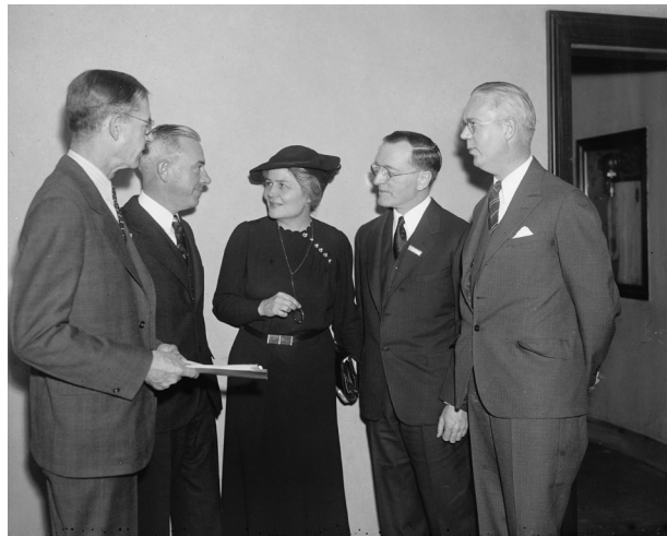
Josephine Roche, center, with public health officials and doctors, opening a U.S. Public Health Service conference on “venereal”—i.e., sexually transmitted—diseases, January 1936. Roche, who as assistant secretary of the treasury oversaw the Public Health Service, had advocated for funding for public health clinics in the Social Security Act of 1935, testifying that of the 750,000 cases of syphilis in America each year, more than half did not get treatment within the first two years.

Florence Allen (holding the flag) and other activists for women’s suffrage in Cleveland, Ohio, 1912. Allen would be the first woman to serve on a state supreme court—Ohio’s—and in 1934, Franklin D. Roosevelt would make her a federal judge. Allen would serve on the U.S. Court of Appeals for the Sixth Circuit until 1959.