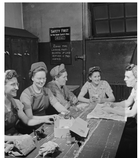
Women workers lunch in the women's locker room at the yards of the Pennsylvania Railroad in Pitcairn, Pennsylvania; May 1943.