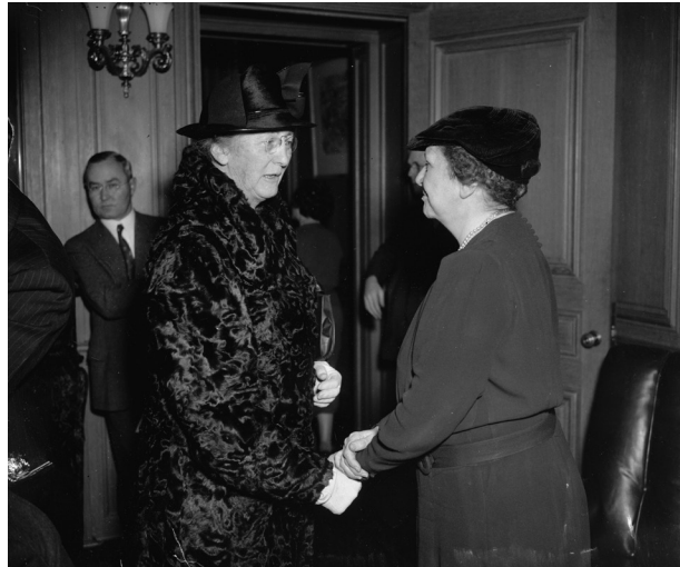
Social Security Board member Molly Dewson, left, with Secretary of Labor Frances Perkins, January 22, 1938. Dewson, an astute Democratic Party operative whom Franklin D. Roosevelt nicknamed “the little general,” had lobbied FDR to appoint Perkins as the first woman ever to hold a cabinet post.

veterans camped near Washington, DC, to demonstrate for benefits—a repeat of a 1932 march that had ended in eviction by the military. “Hoover sent the army,” one veteran observed, “and Roosevelt sent his wife.” ER’s pull with FDR was strong, and she sometimes played the gadfly, urging him to take on such politically inconvenient causes as ending tolerance for lynching in the South. As the president’s advisor Rexford Tugwell would recall, “No one who ever saw Eleanor Roosevelt sit down facing her husband, and, holding his eye firmly, say to him, ‘Franklin, I think you should . . .’ or, ‘Franklin, surely you will not . . .’ will ever forget the experience.” Nationally syndicated political columnist Raymond Clapper put it more bluntly, naming ER one of the ten most powerful people in Washington.