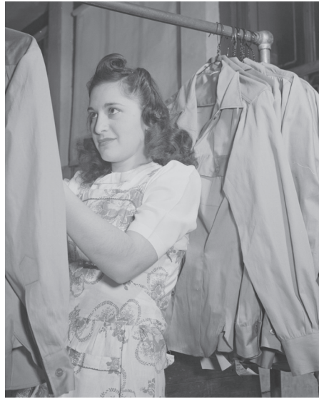
A Jewish garment worker at the N.M. dress shop in New York City making blouses for the Women’s Army Auxiliary Corps, January 1943. New Deal legislation guaranteeing a minimum wage and overtime pay helped women in traditionally low-paying mass production industries like the garment trade. So did laws enshrining the right to bargain with employers through unions—in this worker’s case, Local 89 of the International Ladies’ Garment Workers’ Union.

In 1935, after the Supreme Court invalidated NIRA and the hour and wage laws it established, Secretary of Labor Frances Perkins drafted a bill that set a federal minimum wage and a forty-hour work week and outlawed child labor in